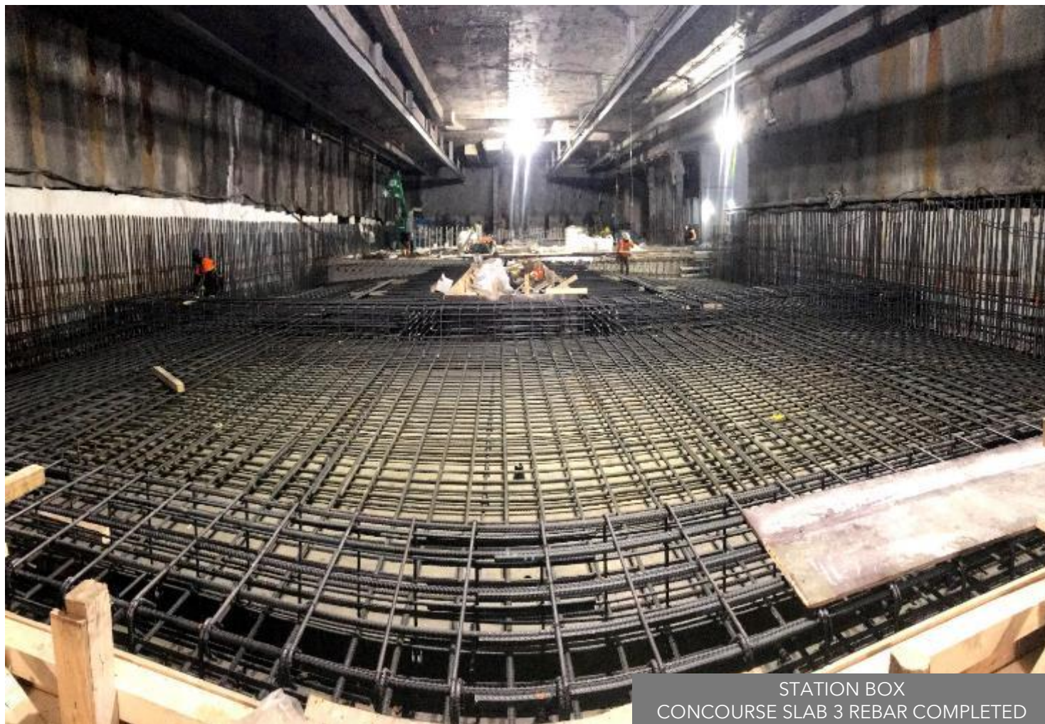
STATION BOX CONCOURSE SLAB 3 REBAR COMPLETED