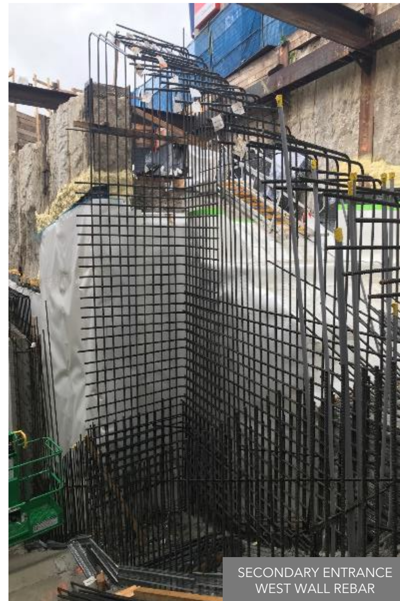
SECONDARY ENTRANCE WEST WALL REBAR