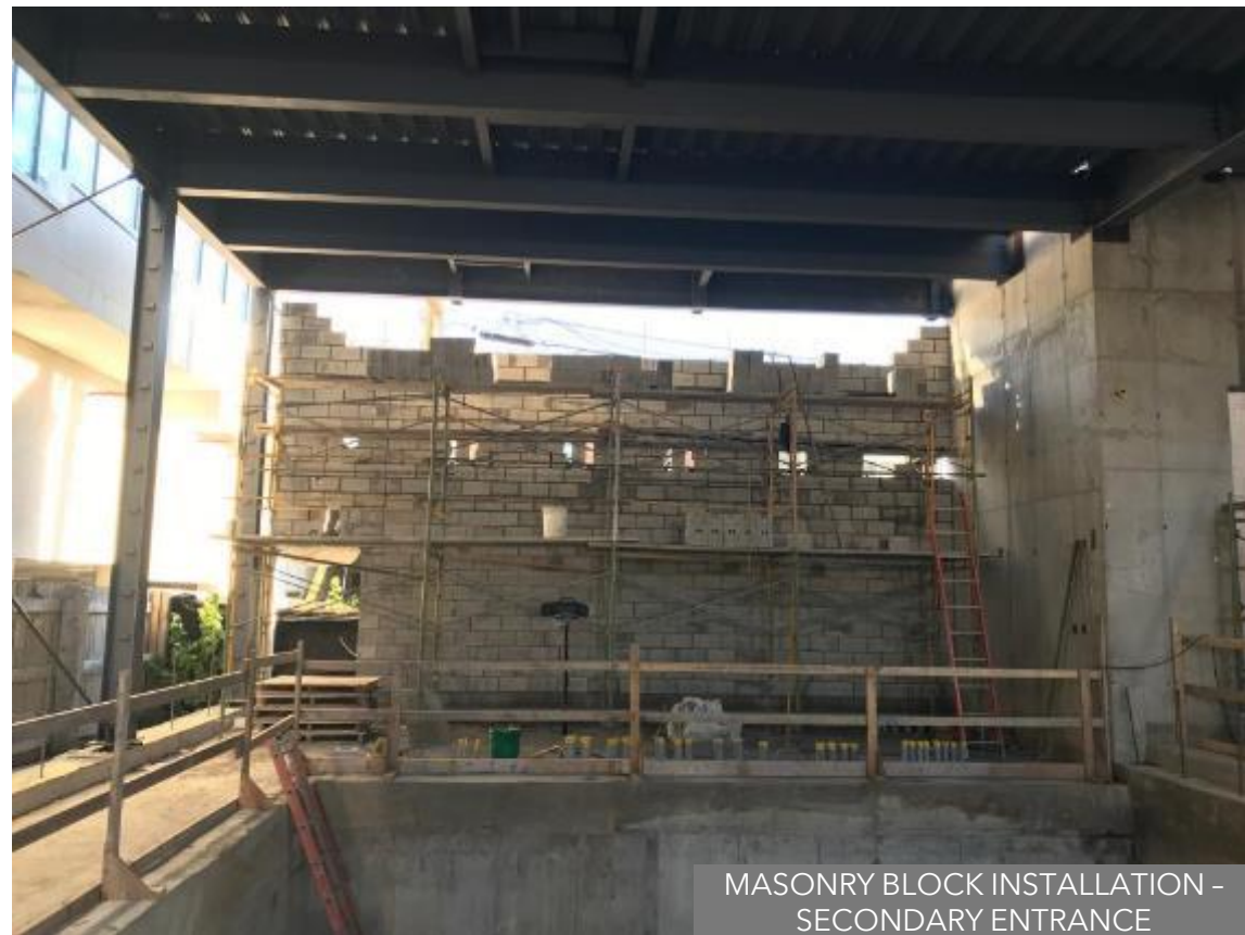
MASONRY BLOCK INSTALLATION - SECONDARY ENTRANCE