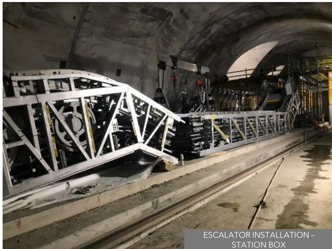
ESCALATOR INSTALLATION - STATION BOX